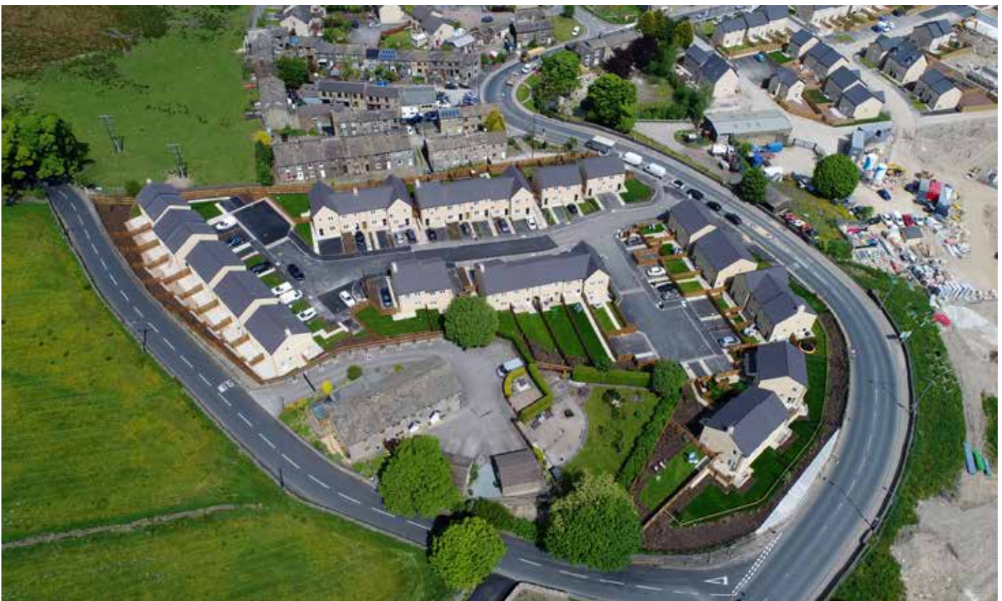
Denholme, Bradford.